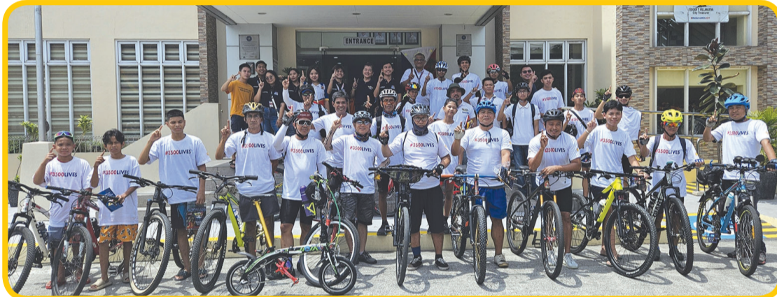
Kita Kita Ka-Bisikleta Program cyclist participants at Barangay Batasan Hills, Quezon City wearing the #3500Lives shirts.