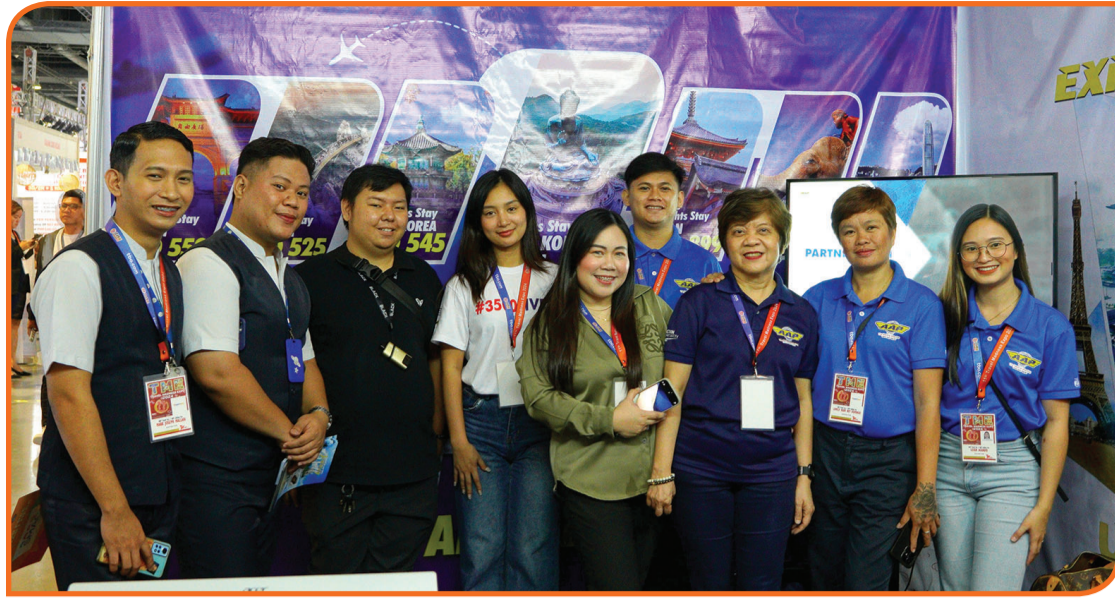
AAP Travel employees and SM Mall of Asia staff get together for a photo op during the 2024 Travel Madness Expo (TME).