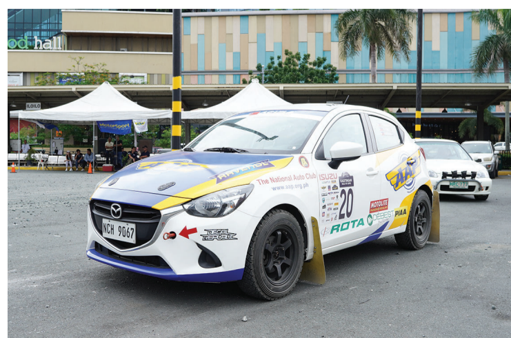
The AAP rally car was used as a practice vehicle by the instructors and students.