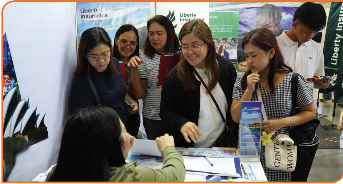
TME visitors flocking the AAP Travel booth which was open July 12-14, 2024.